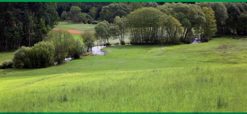
Lower Austria: a hiker's paradise along the River Kamp