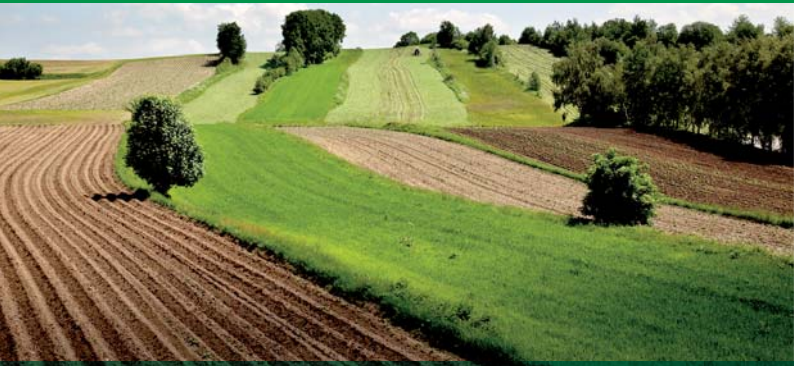
Lower Austria: Traditional landscape in Großschönau (A. Schneider)