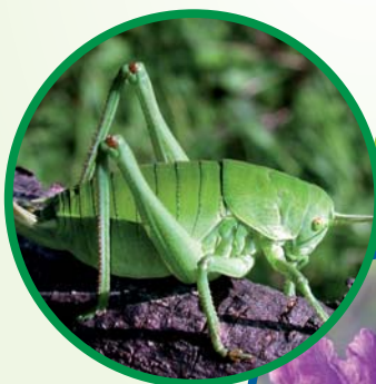
Saw-tailed bush cricket (J. Weinzettl) Dwarf iris (A. Schneider), Daffodil (Arge NATURSCHUTZ)

For example, the lynx has been prowling in the Bohemian forest for a number of years. At the Langen Luss floodplain in Lower Austria, tadpole shrimps ( Triops cancriformis ) frolic in temporary pools during stormy summers, the beautiful European green lizard ( Lacerta viridis ) sunbathes in the dry grasslands of Burgenland. In the diverse eastern Styrian cultural landscape the European roller ( Coracias garrulous ) perches high up looking out for prey and bear bridges in Carinthia facilitate immigration of the brown bear from Slovenia.