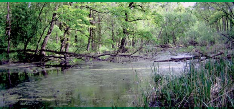
Lower Austria: Hotspot March-Thaya floodplains