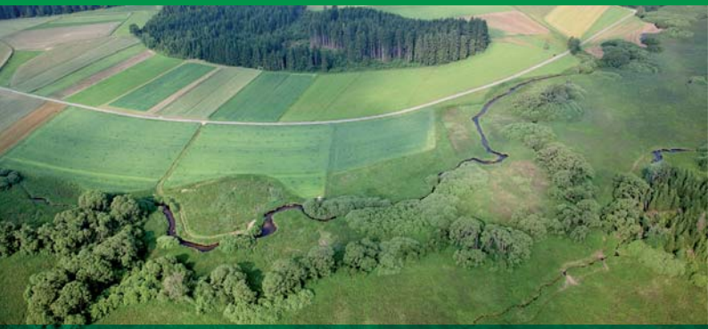
Upper Austria: River Malsch on the border to the Czech Republic