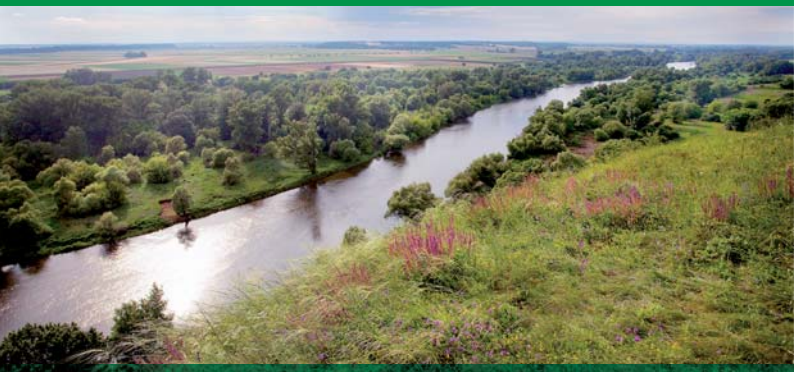
Lower Austria: The river March as seen from the Thebener Kogel