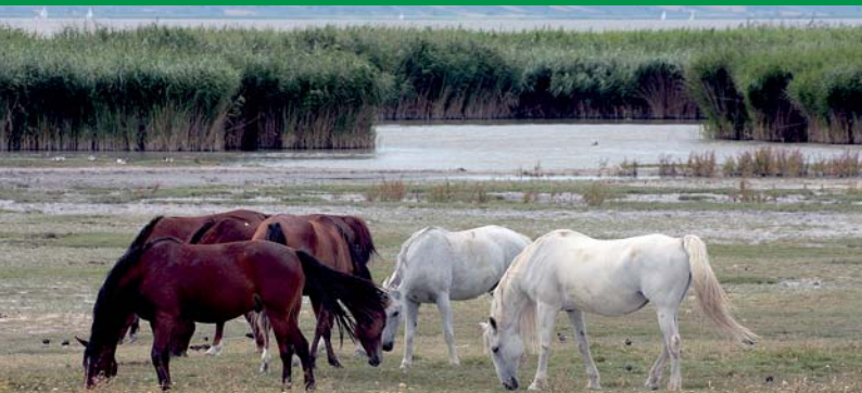
Burgenland: Horses grazing at Lake Neusiedl (J. Limberger)