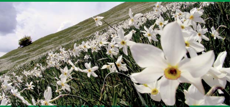
Carinthia: Daffodil Meadows in the Karawanks