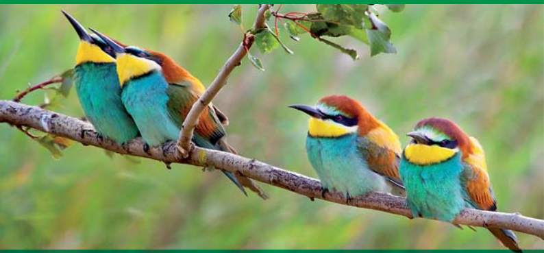
Styria: Bee-eaters can be found on the sandy slope Katzengraben