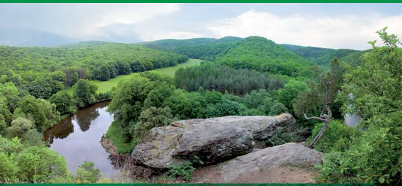
Lower Austria: Thayatal National Park