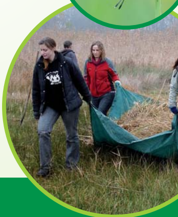
Mountain Alcon Blue, at significant risk of extinction (piclease / E. Dallmeyer); Mowing and maintaining sensitive meadows in Lower Austria (J. Frühauf)