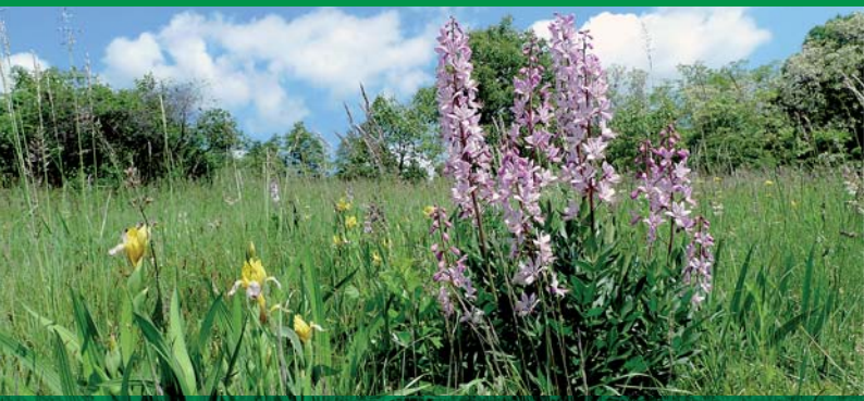
Burgenland: Dry grassland near Rechnitz saved through land acquisition (J. Weinzettl)