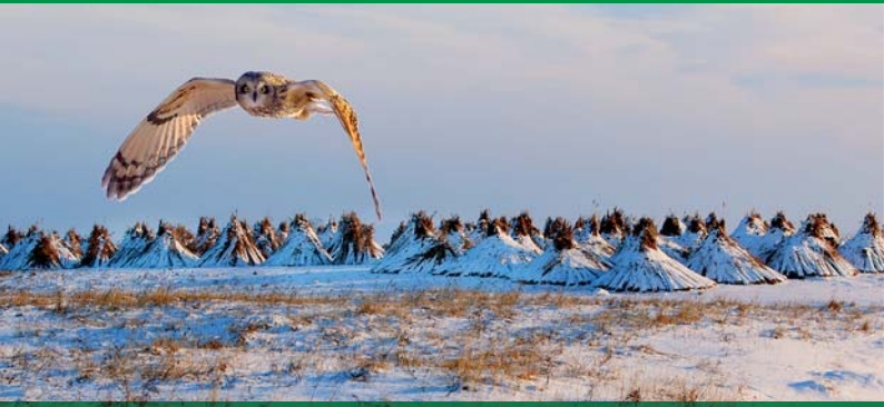
Lower Austria: Short-eared owl at National Park Lake Neusiedl (A. Schneider)